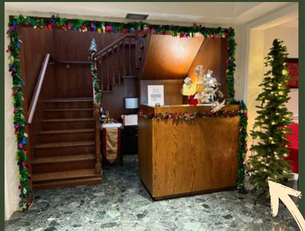
Our office is ready for the holiday season!